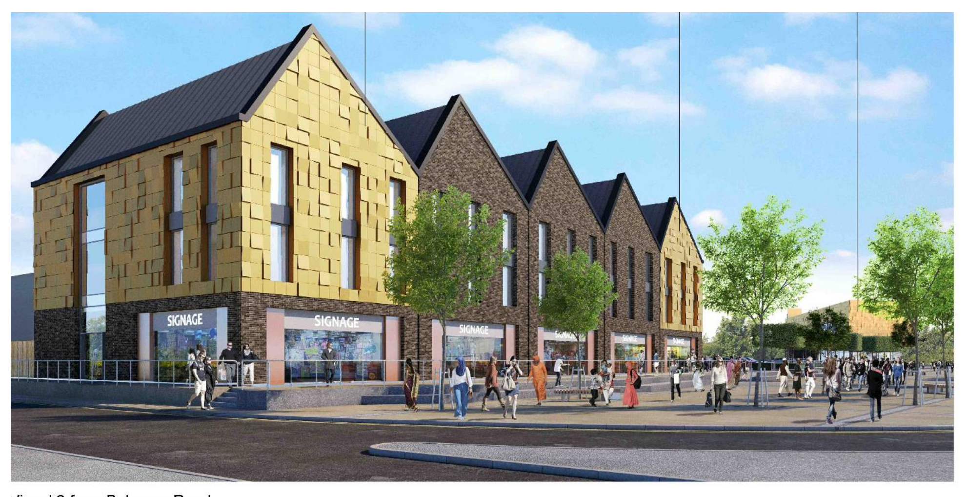
Visual 2 from Belgrave Road