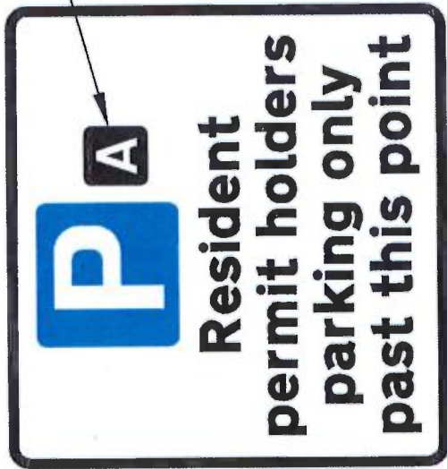
Zone entry plates