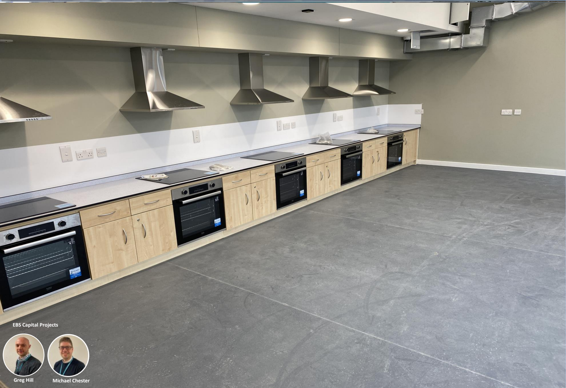
EBS Capital Projects