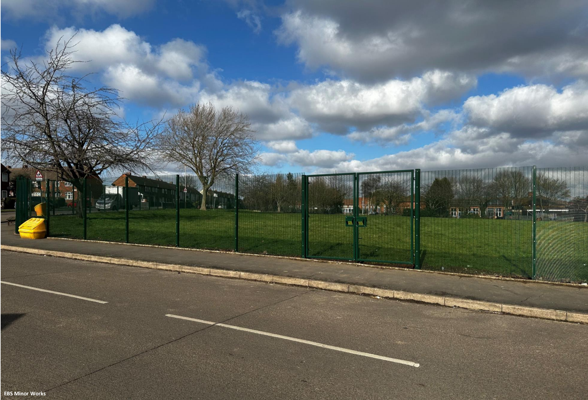
EBS Minor Works